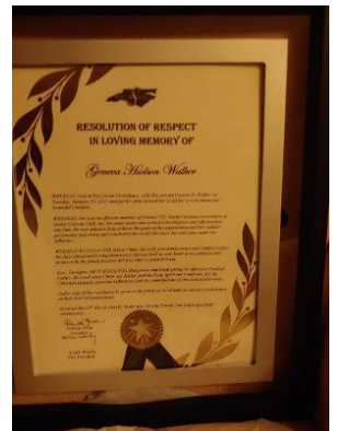
Example of a Resolution

Remember me when I am gone But not with sorrow, pain and grief Think of me as a turning leaf That in the winter falls from its branch To be born again in spring And live forever in your heart